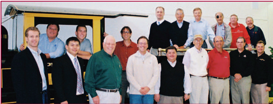
Leadership from the Foundation board, Home Association, and Chapter Advisors with the Boilermaker special.