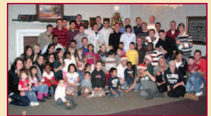
Brothers from Pi Kappa Alpha, sisters from Delta Zeta, and children from Head Start at a Christmas party.