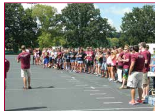
Participants in the first annual Pike's Fireman Challenge.