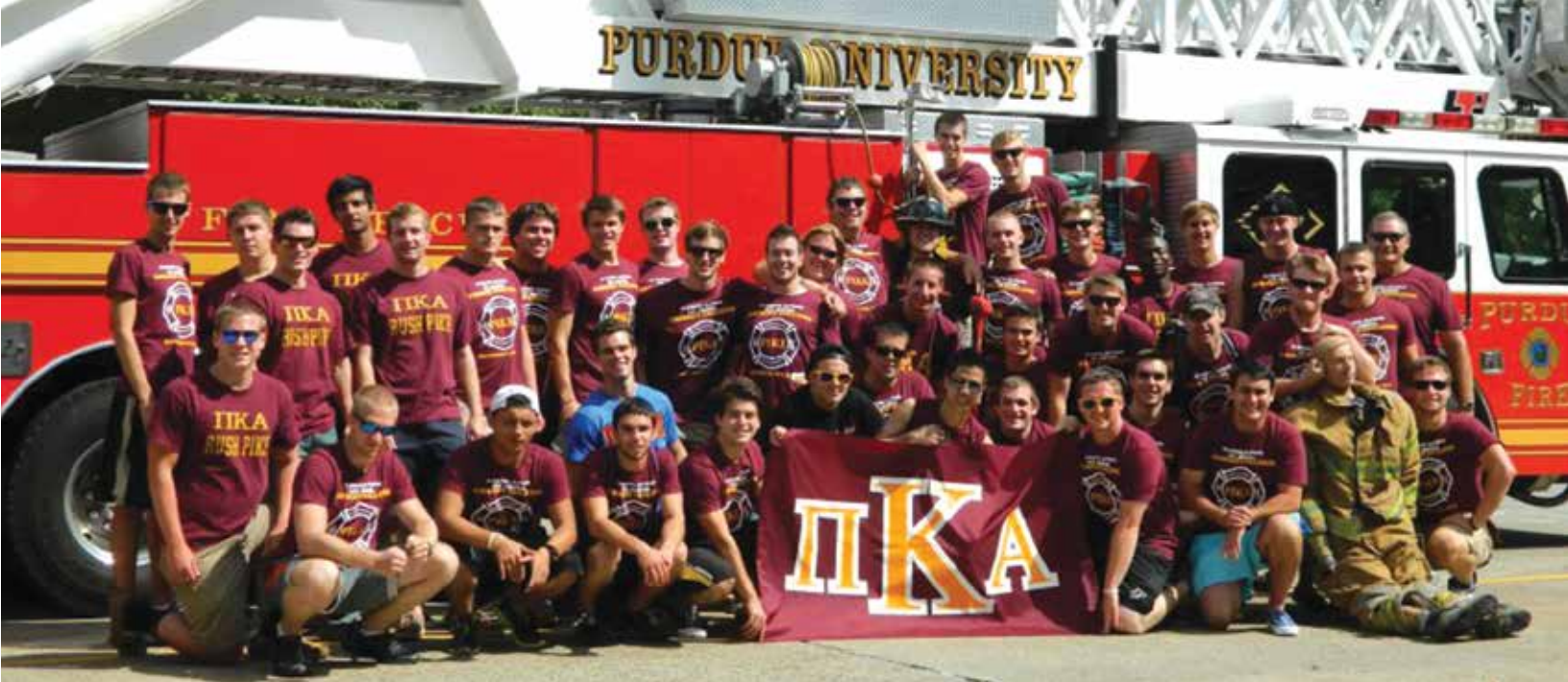
Brothers at the Pike's Fireman Challenge philanthropy.