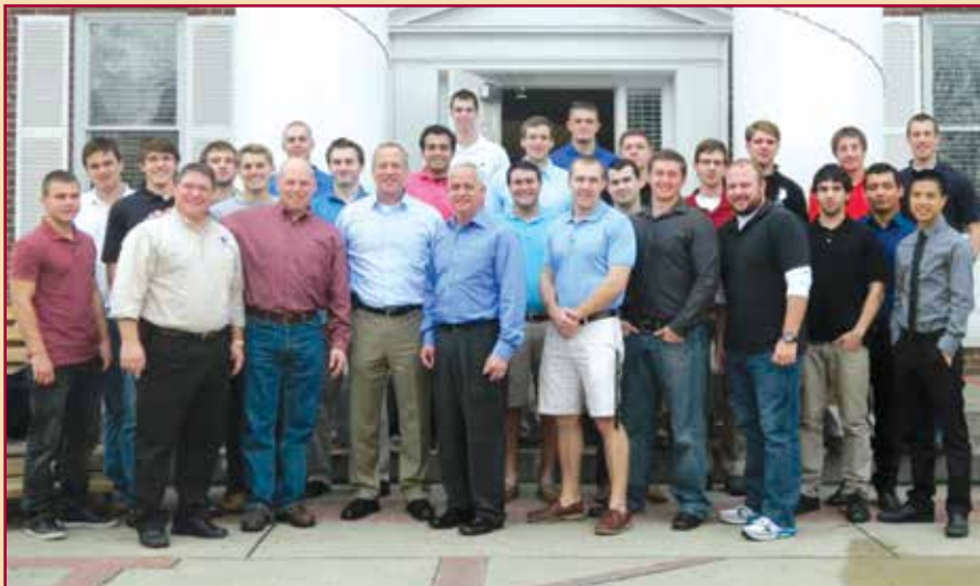
Brothers and alumni at the Chapter's annual Pike Old Masters event.