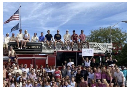
Brothers and guests at the PIKE Fireman's Challenge.