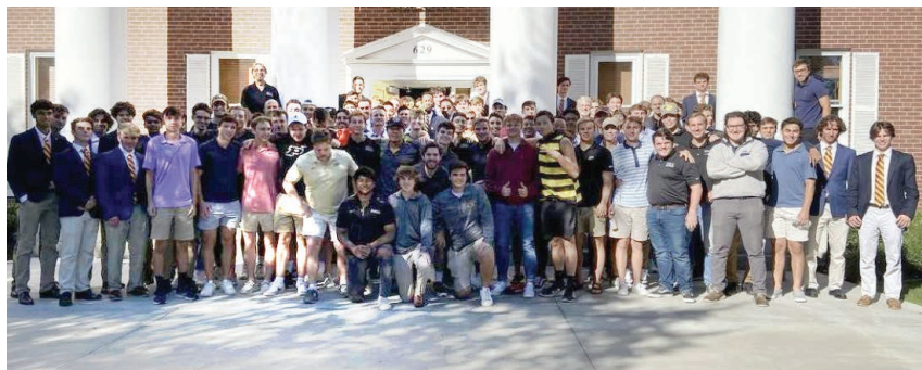
Thank you to everyone who joined us for Alumni Day!

Active Members Stay Involved in Activities and Philanthropy