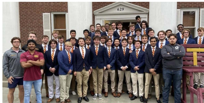
We welcomed 38 new members to Beta Phi this year.

H ello, Beta Phi brothers. The year is coming to an end, and our active members have embraced the fall semester. We welcomed an excellent new member class, participated in many events, and enjoyed our brotherhood.