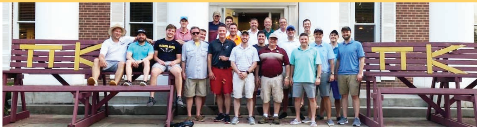
It was great to have brothers join us for dinner after a long day of golf!