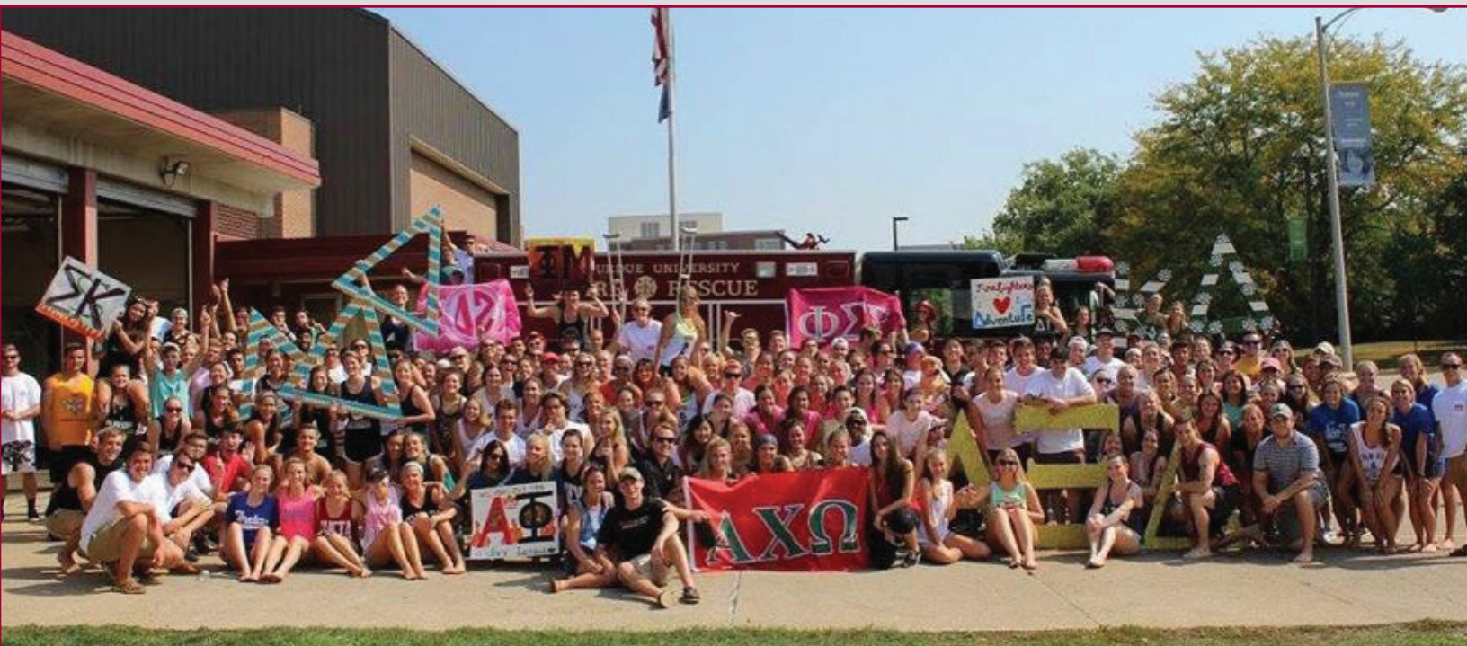
The Chapter with the Purdue Fire Department and the sorority participants after Pike's Firefighter Challenge.