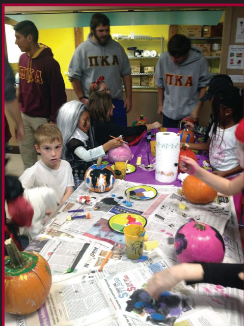
Member help the Boys and Girls Club of Lafayette paint pumpkins for Halloween.