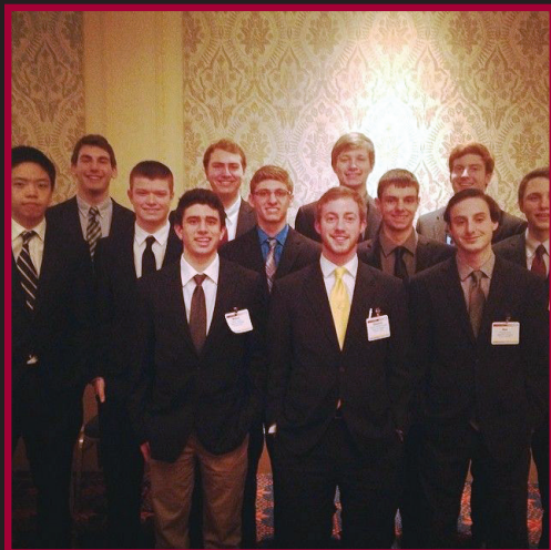
Brothers at the national leadership conference in Chicago, Illinois, in February.