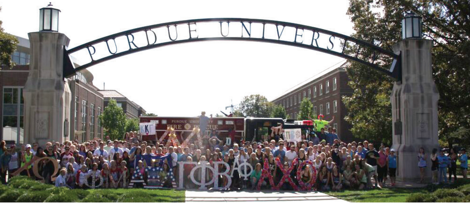
All of the sororities, brothers, and the West Lafayette Fire Department firefighters who participated in our Fireman's Challenge philanthropy.